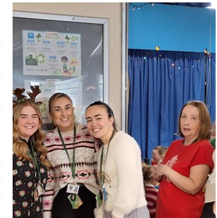
The heat was certainly rising during our Christmas Dinner celebrations! The children were all treated to a sumptuous traditional Christmas roast dinner, served by the school staff to the children. Laughter, singing and plenty of festive joy was bellowing from our school hall. Thank you to our fabulous kitchen staff for providing such a wonderful meal for our children.