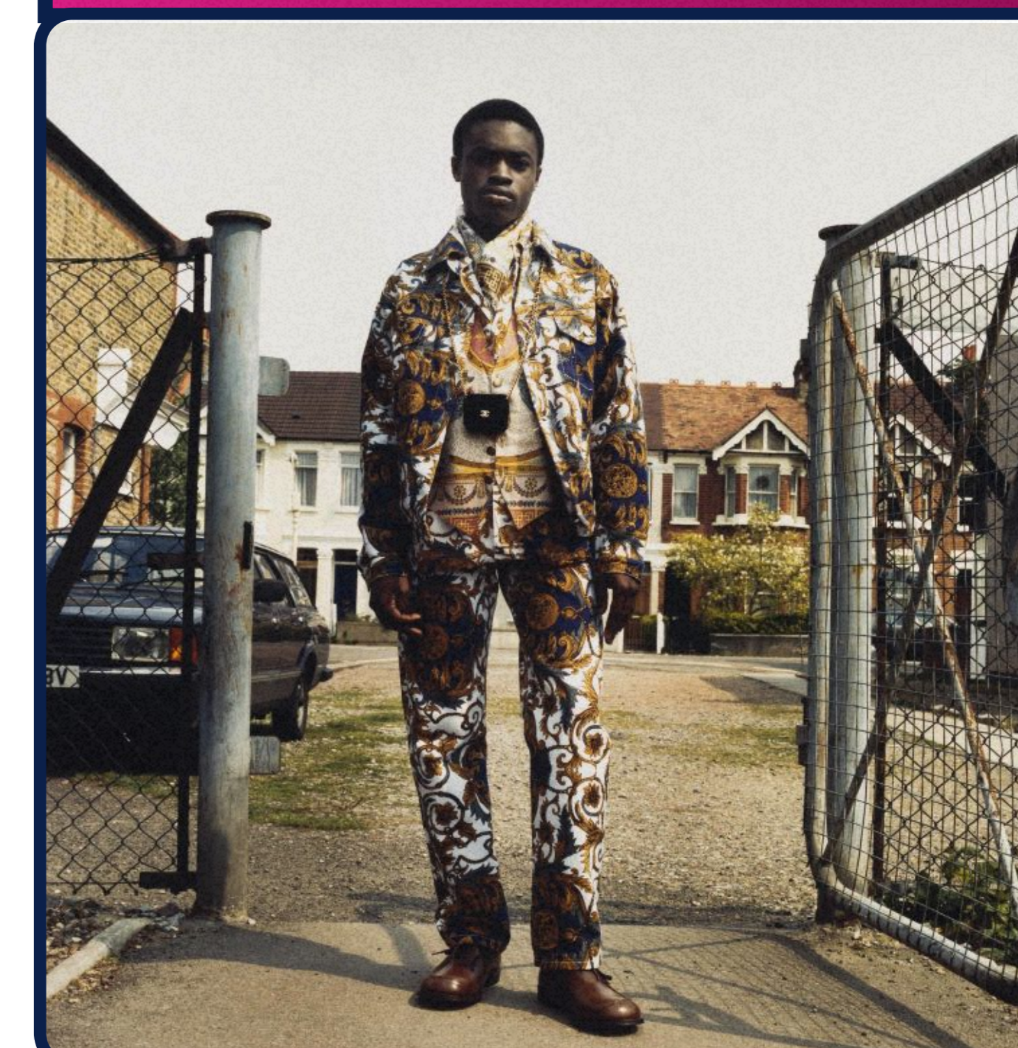
[no title] 1991