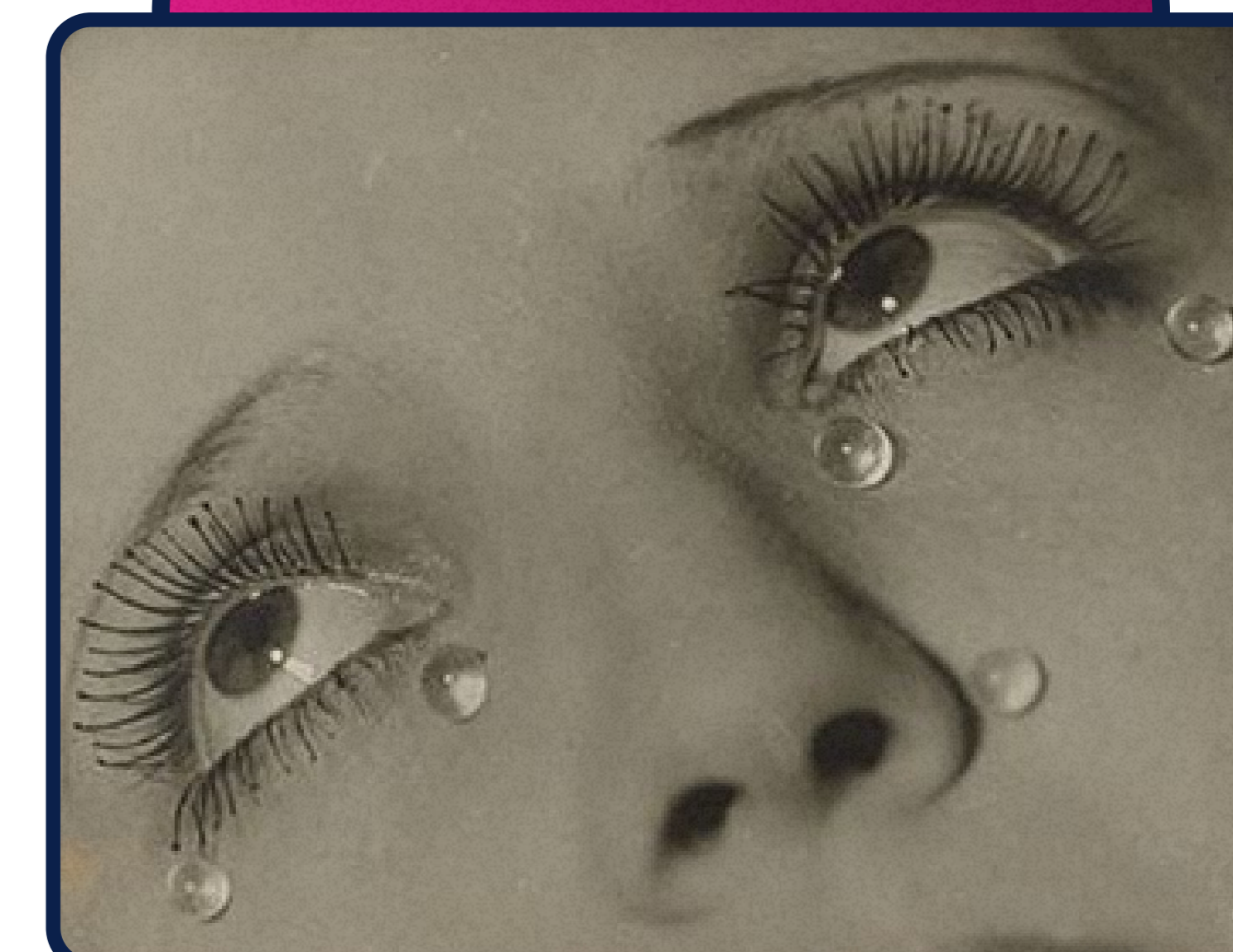
Glass Tears (1932)