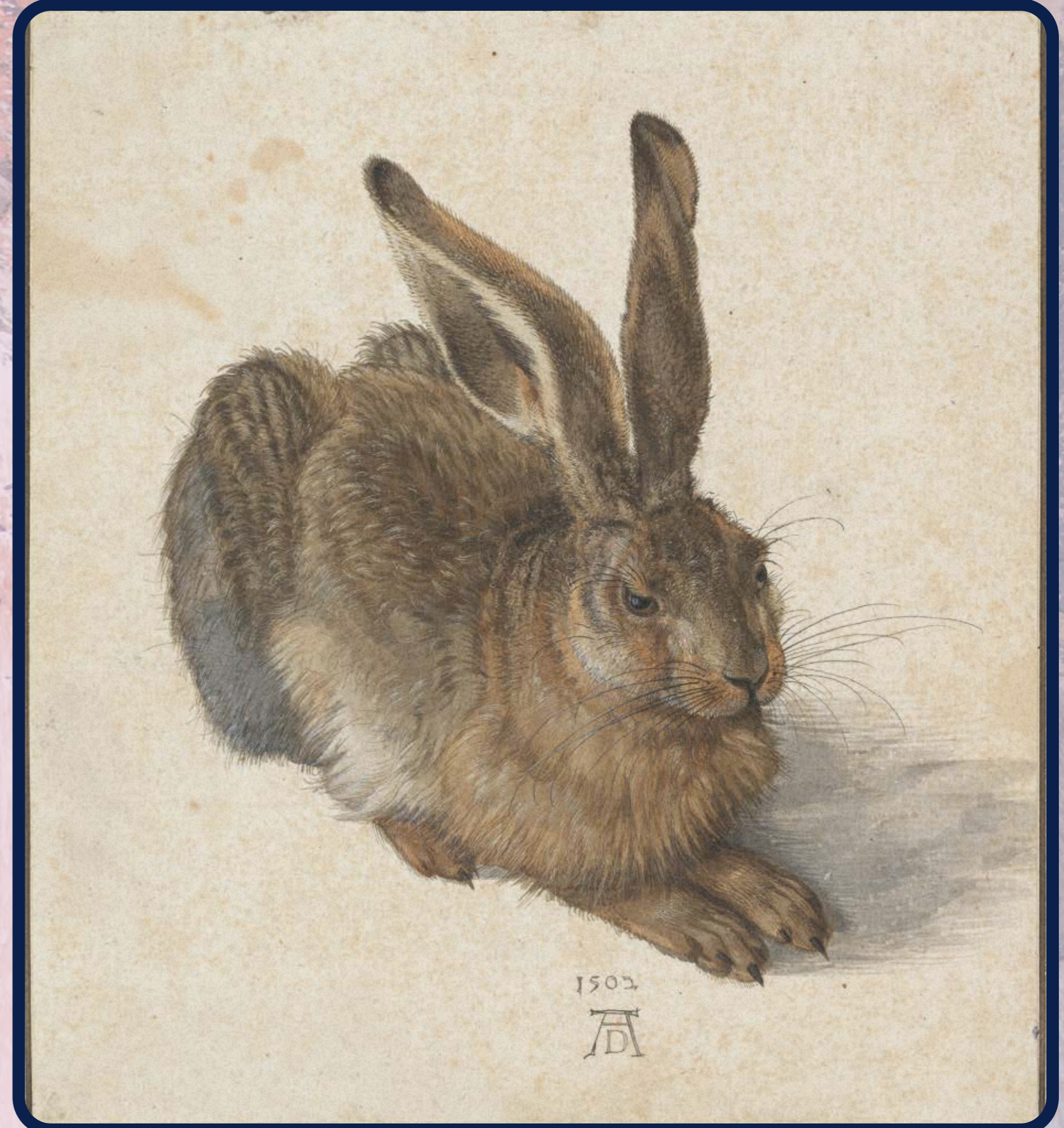
Young Hare (1502)