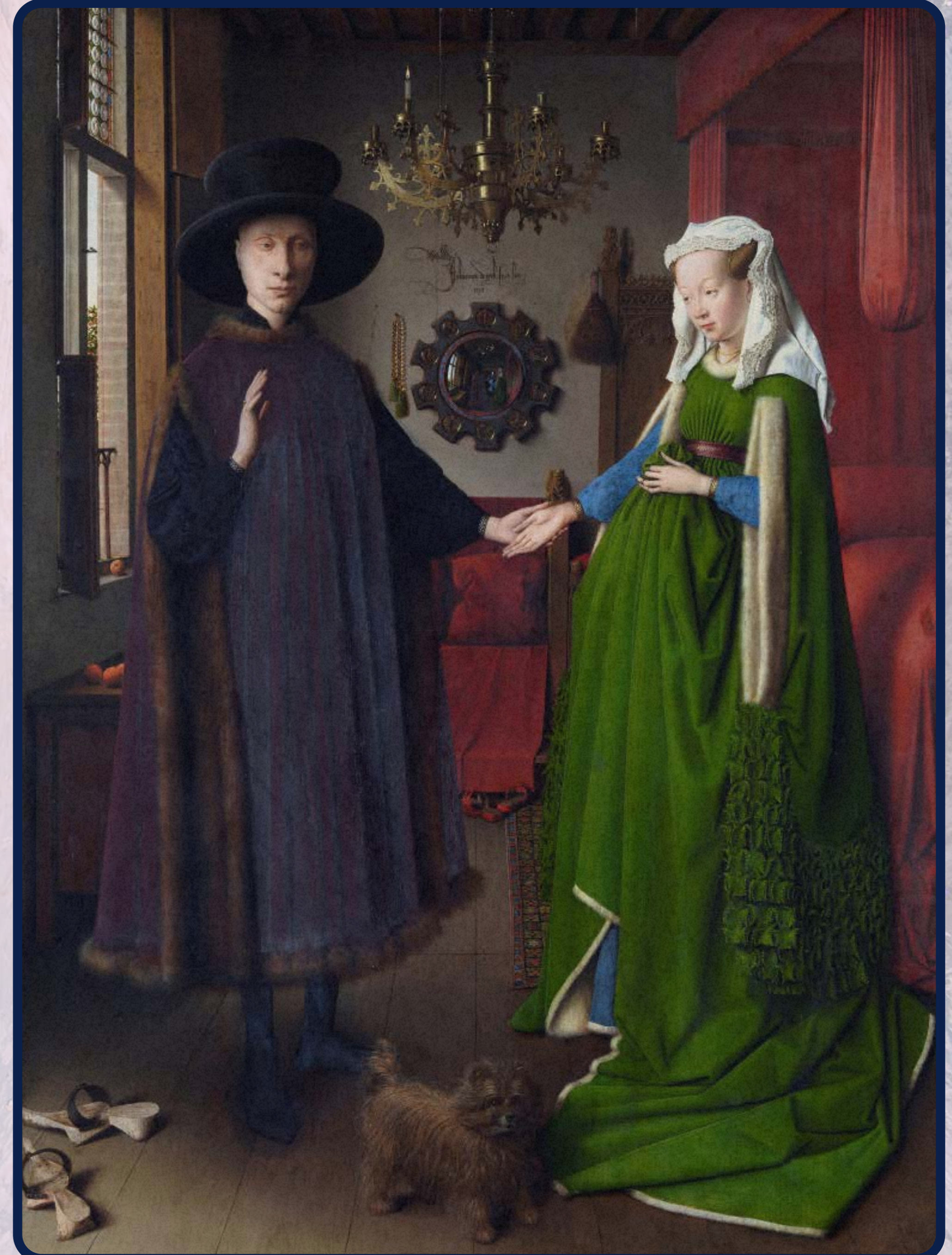
The Arnolfini Portrait (1434)