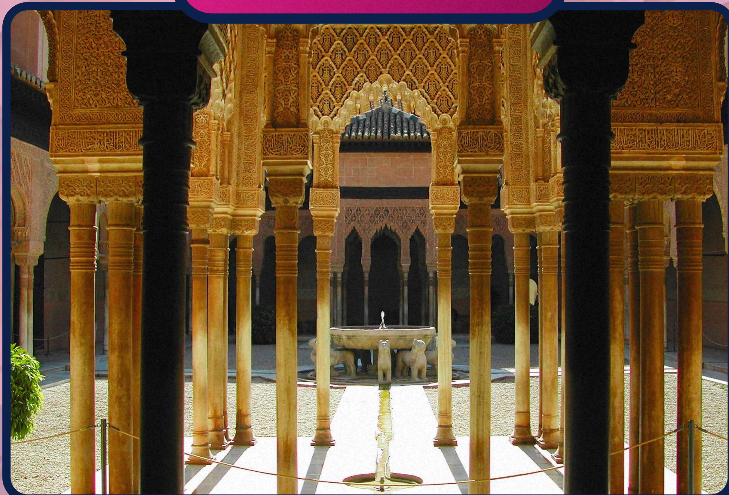
Nasrid Palaces, Alhambra (1300s)