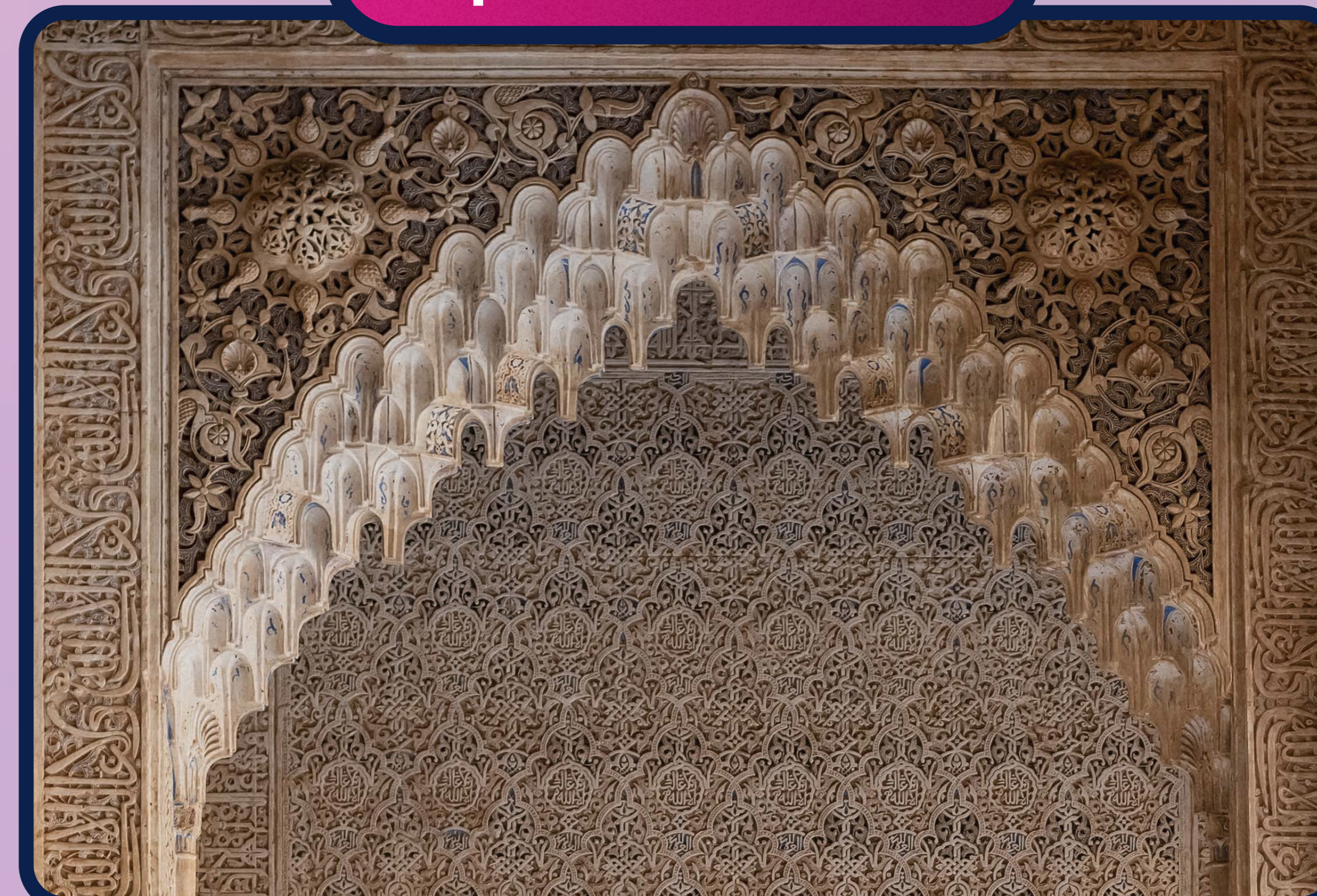
Nasrid Palaces, Alhambra (1300s)