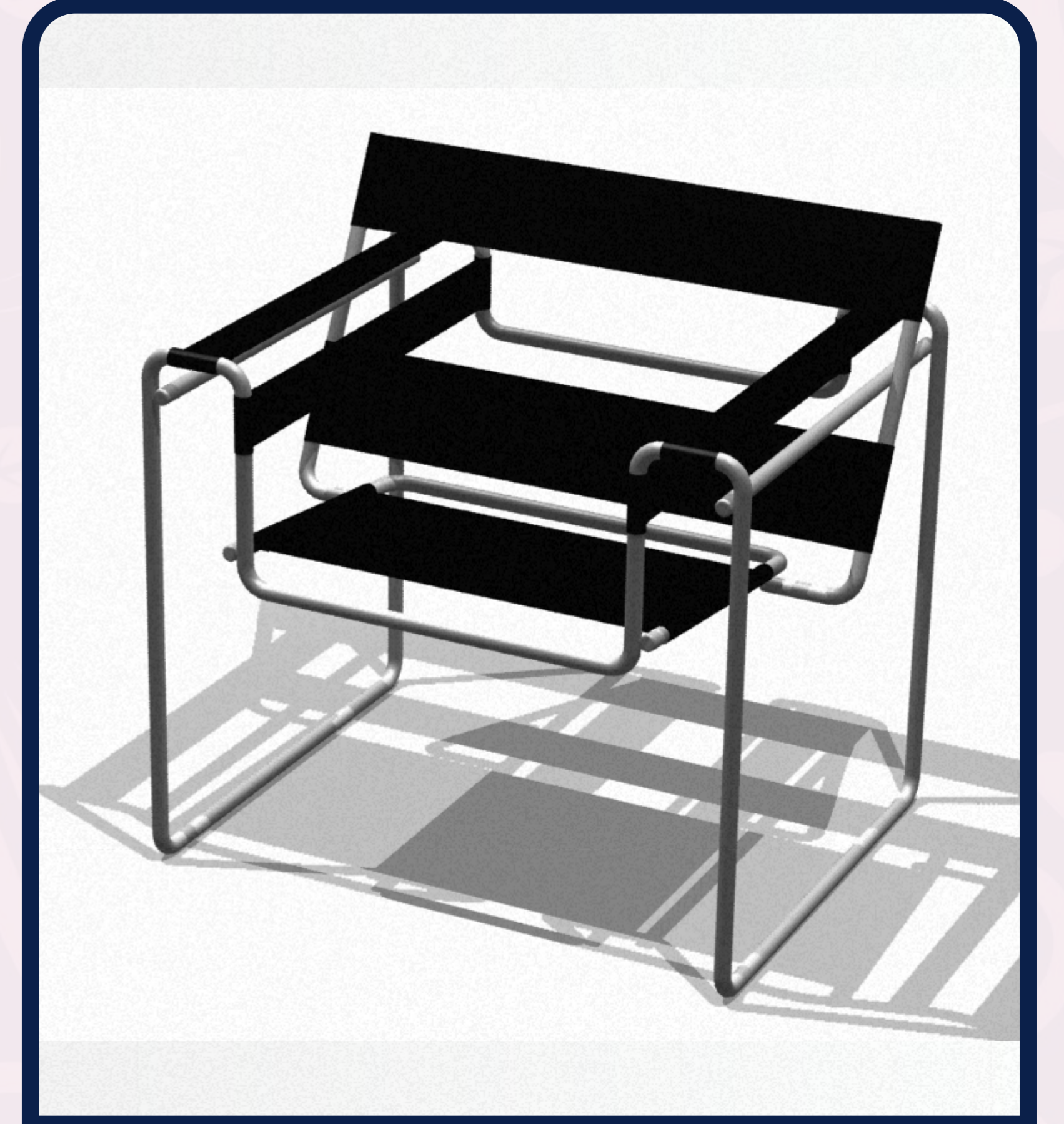
Wassily Chair (1925-1926)