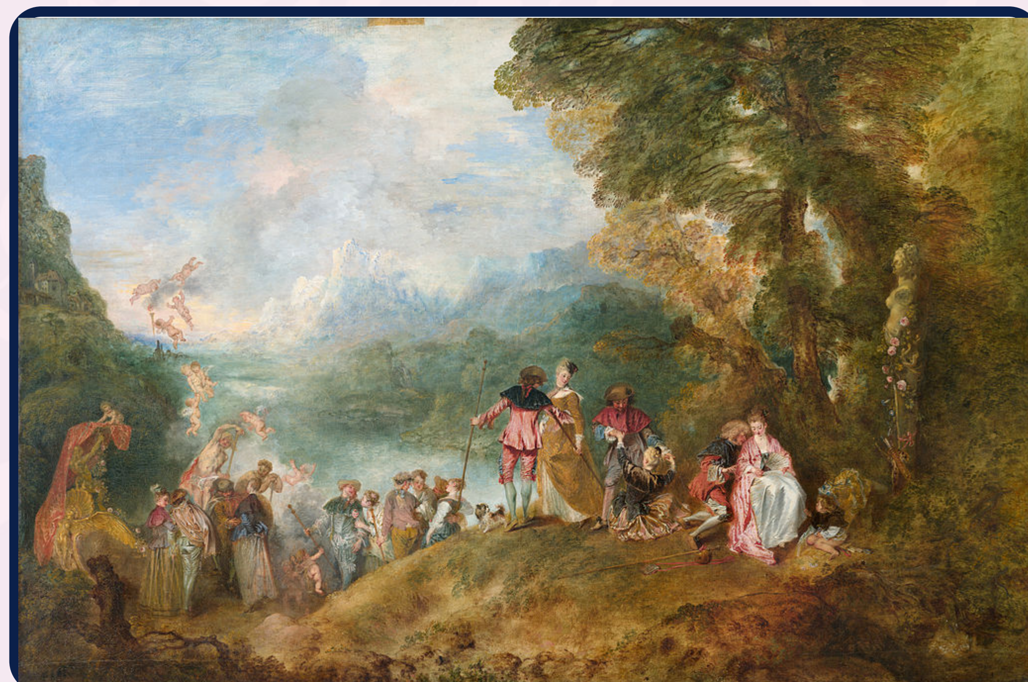
The Pilgrimage to the Isle of Cythera (1717)