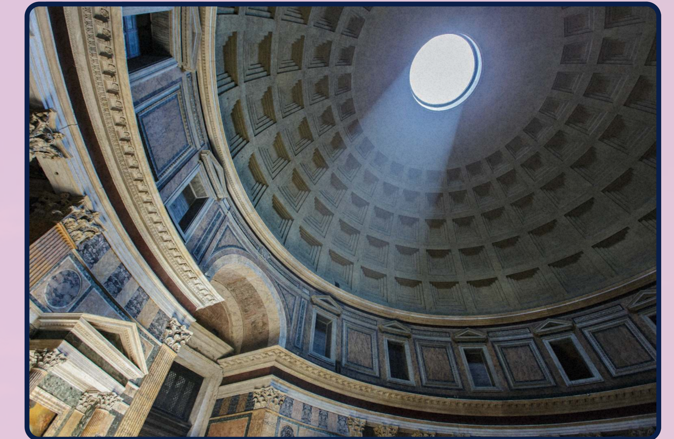
the Pantheon (126 CE)

a band of paintings or sculptures in relief