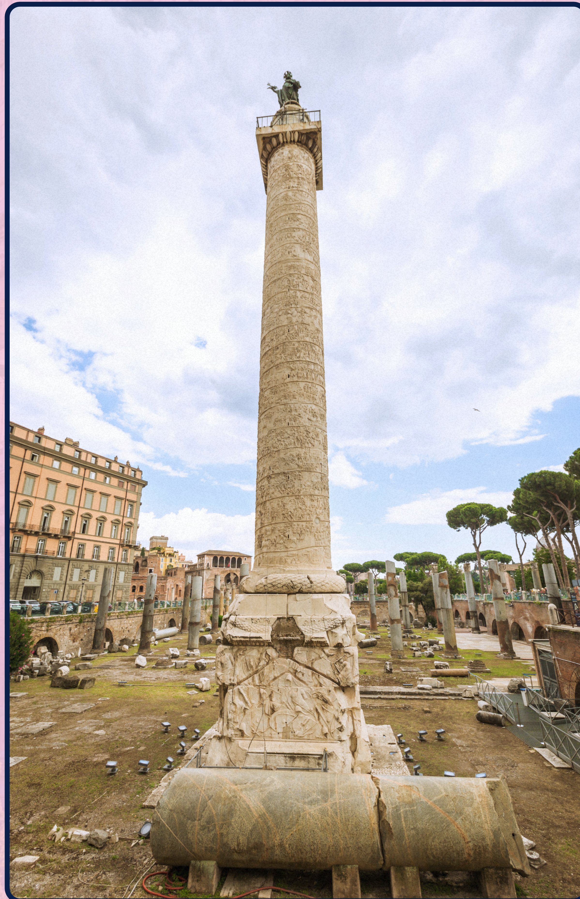
Trajan's Column (113 CE)