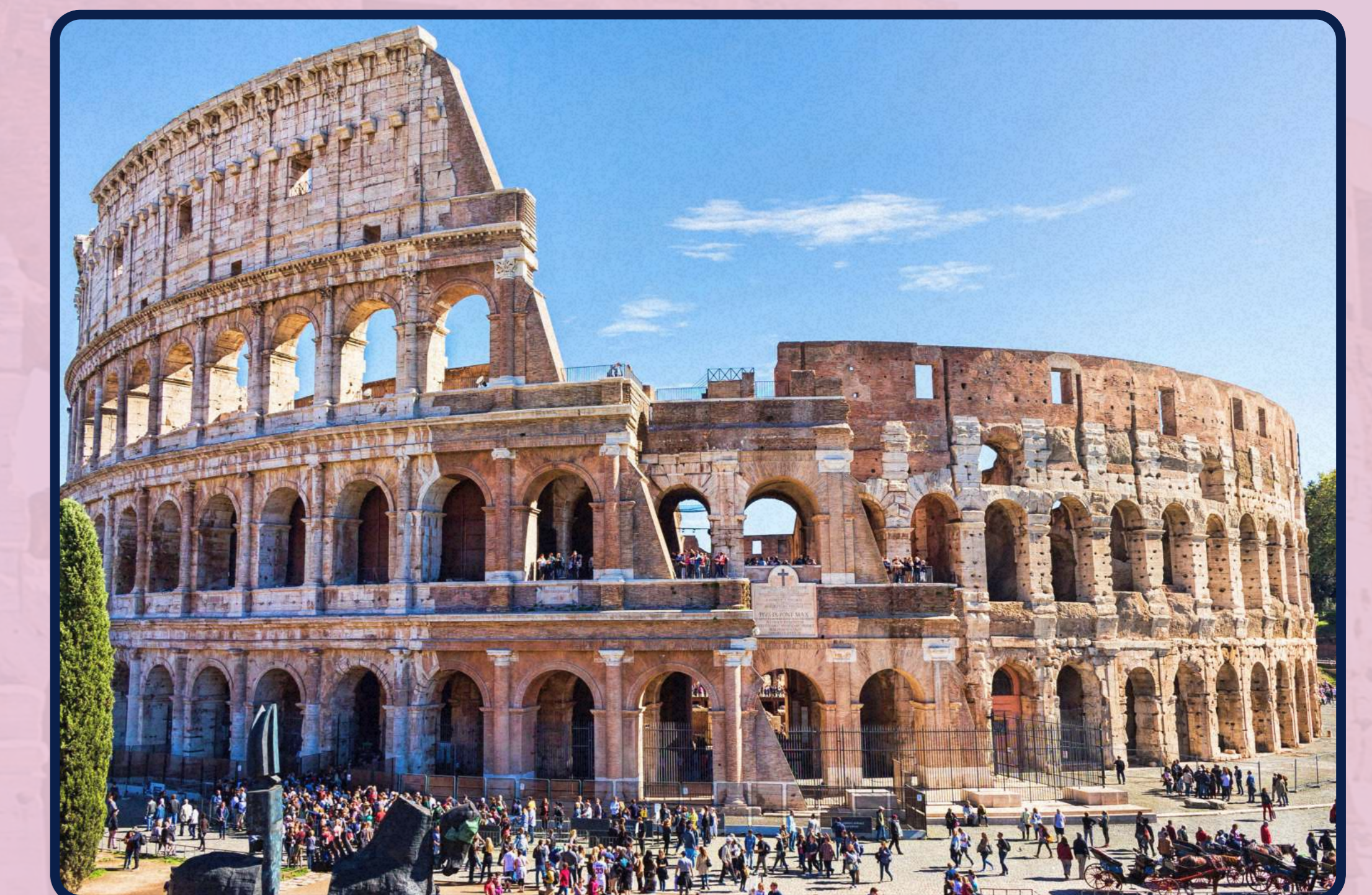
the Colosseum (80 CE)