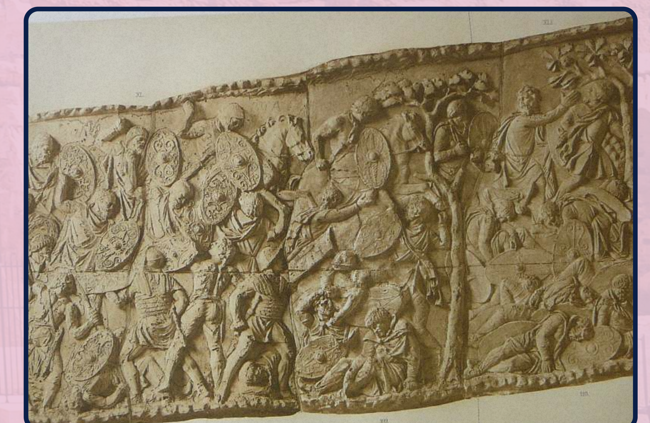
relief from Trajan's Column (113 CE) showing the Roman army