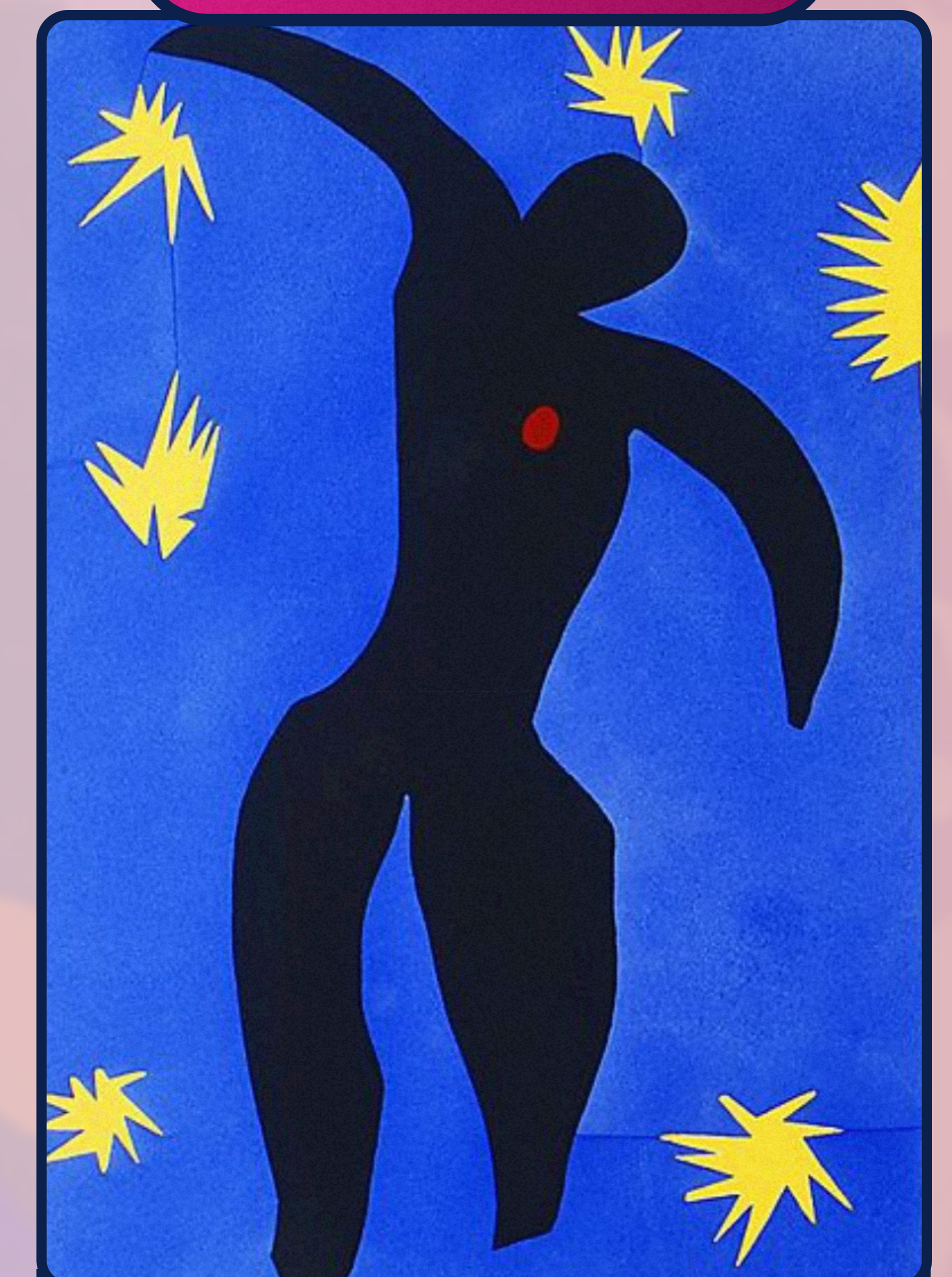
The Fall of Icarus 1947

© 2021 Succession H. Matisse / Artists Rights Society (ARS), New York