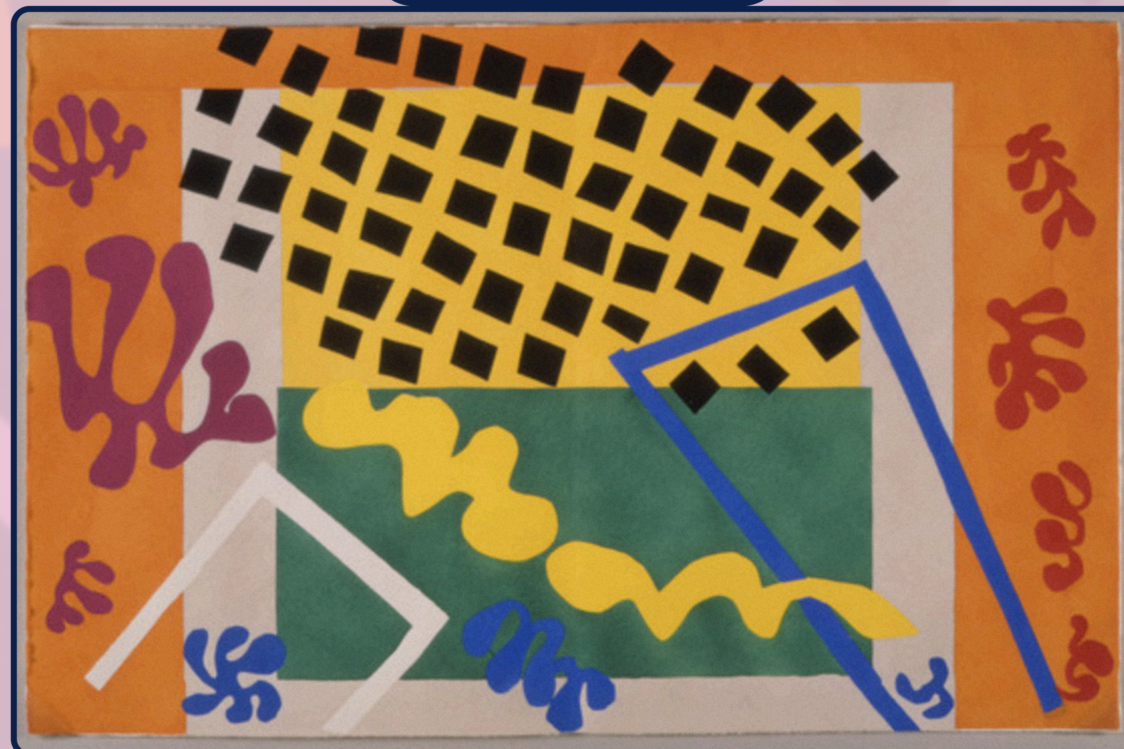
Les Codomas (two famous trapeze artists) 1947

© 2021 Succession H. Matisse / Artists Rights Society (ARS), New York