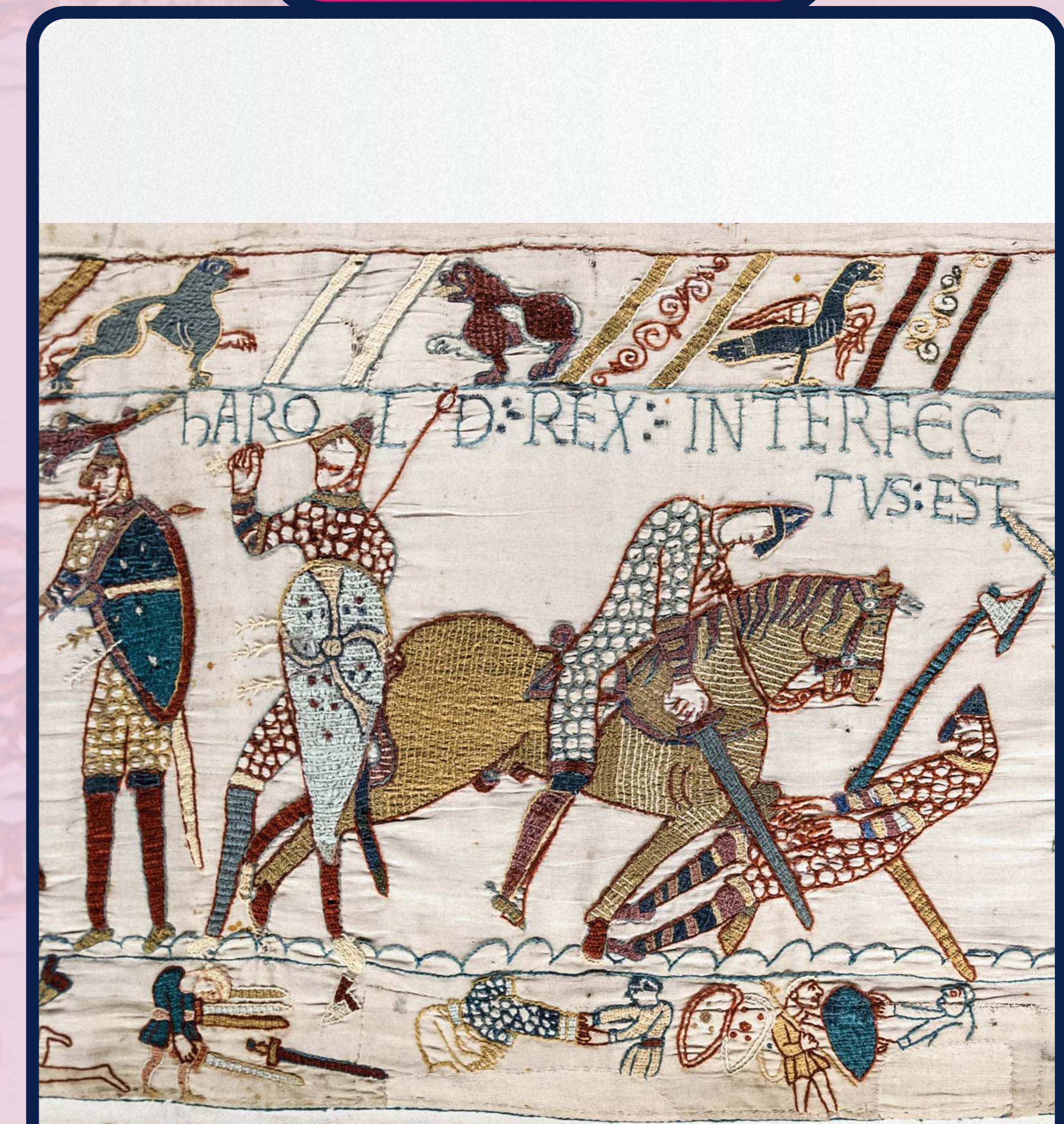
extract from The Bayeux Tapestry showing Harold being shot in the eye