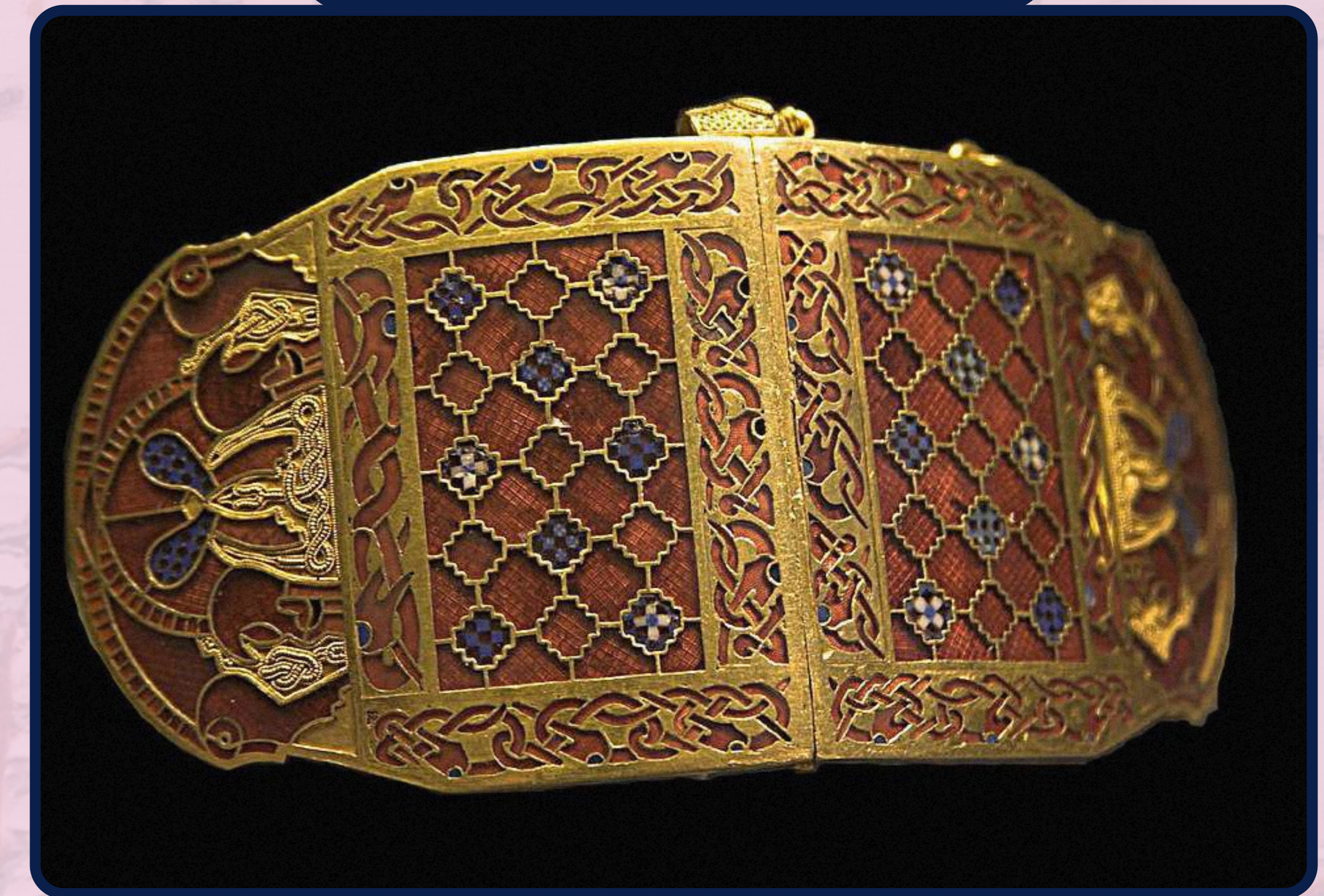
shoulder clasp found at Sutton Hoo