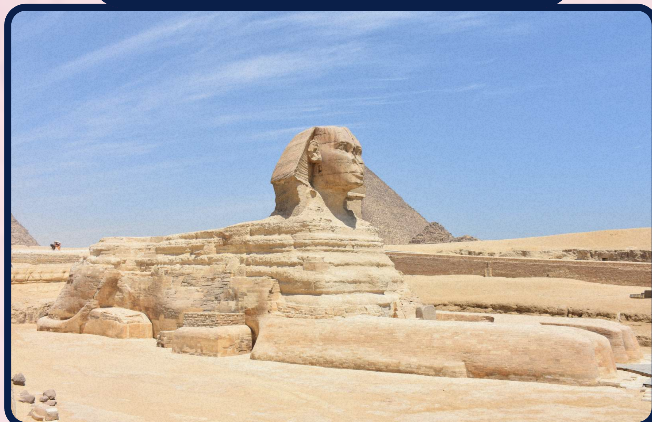
The Great Sphinx