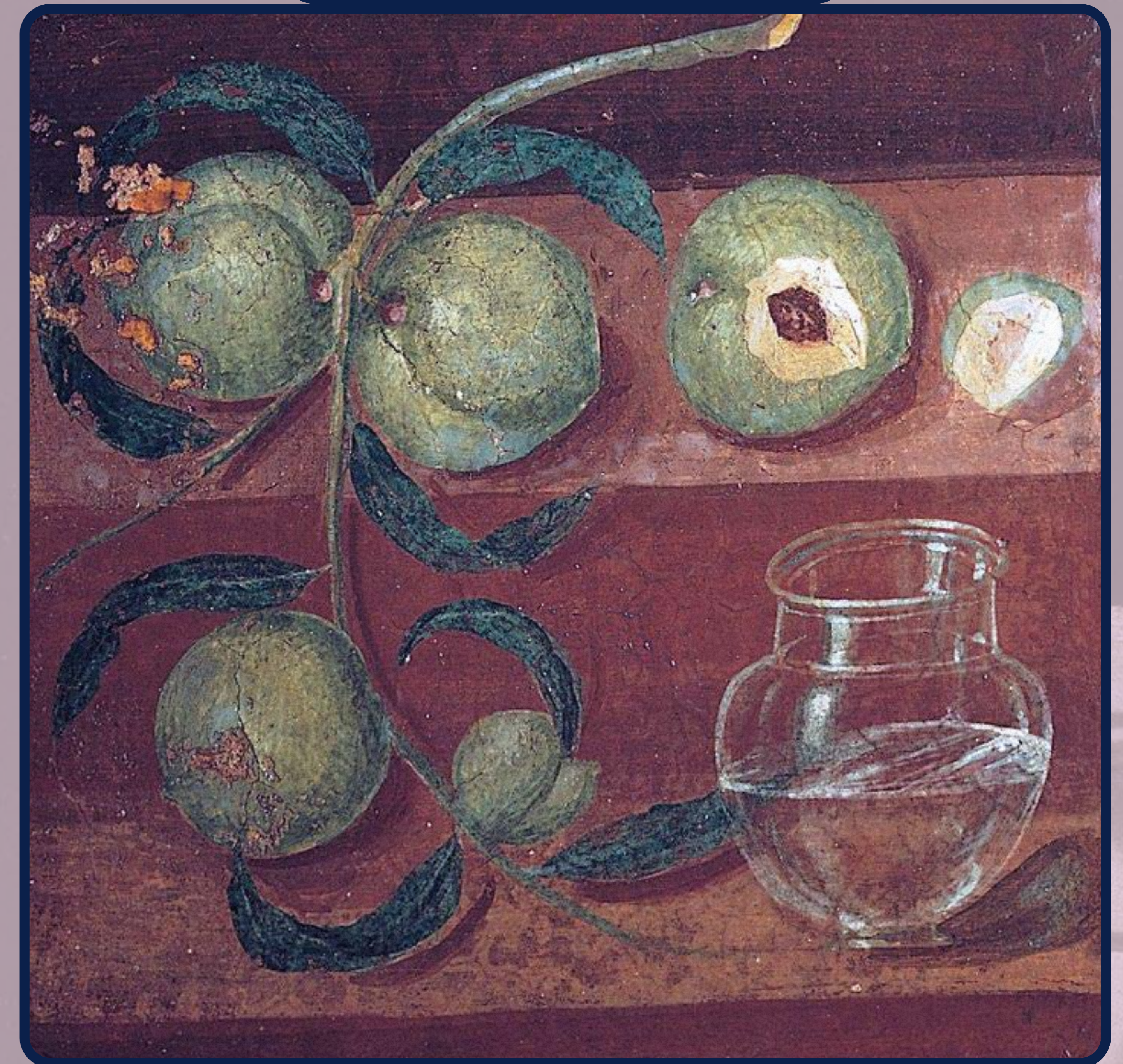
Still Life with Peaches and a Glass (50 CE)