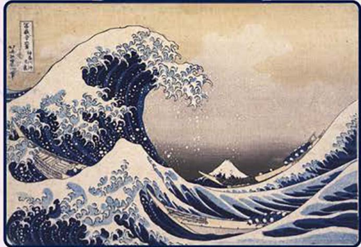
The Great Wave (1829-1833)