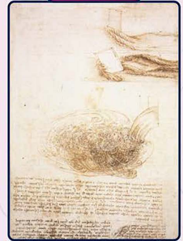
Studies of Water (1508-1509)