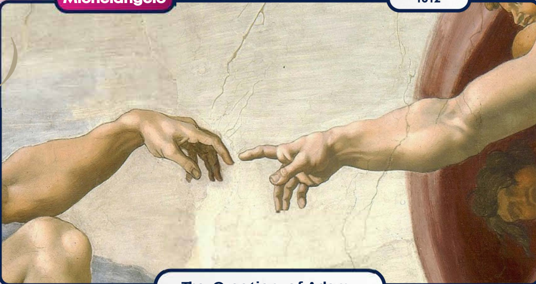
The Creation of Adam