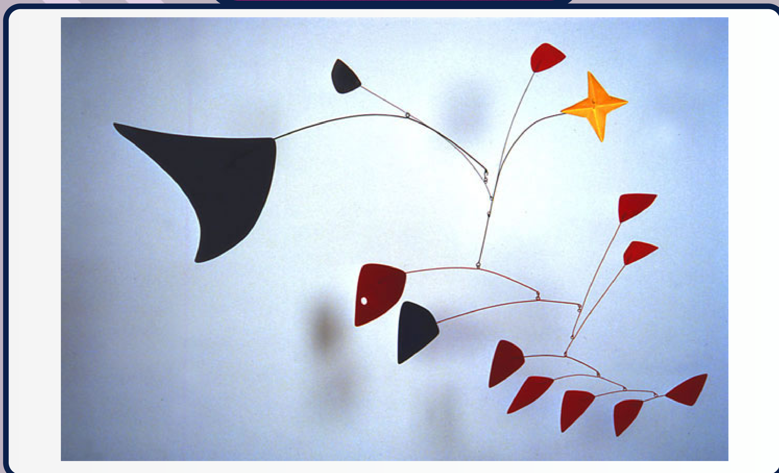
The Star (1960)