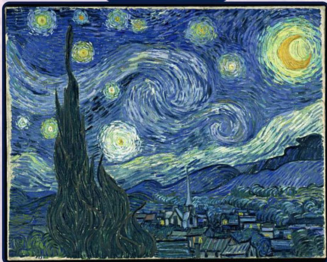
The Starry Night (1889)