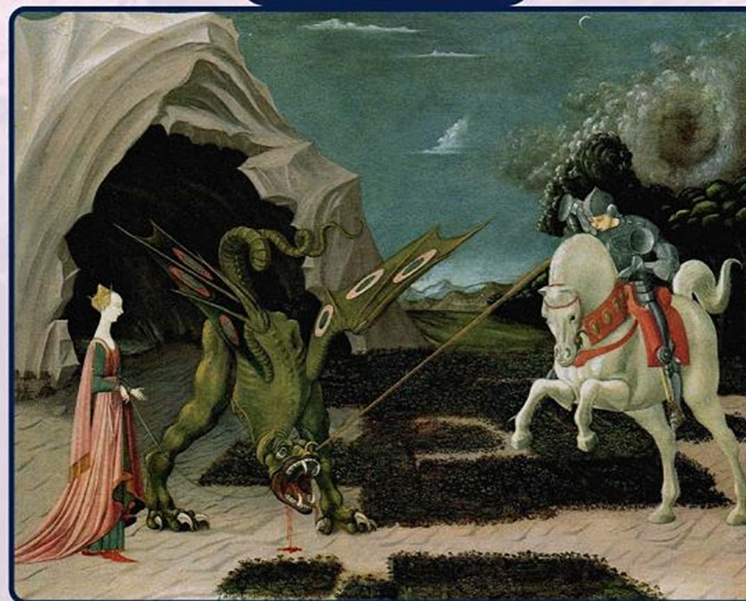
St George and the Dragon (1470)