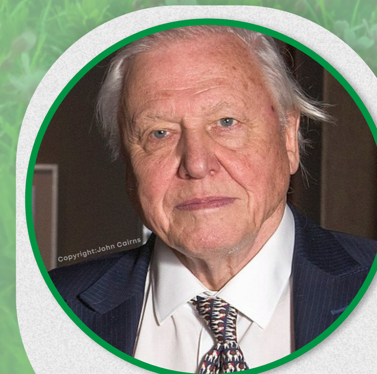
Sir David Attenborough