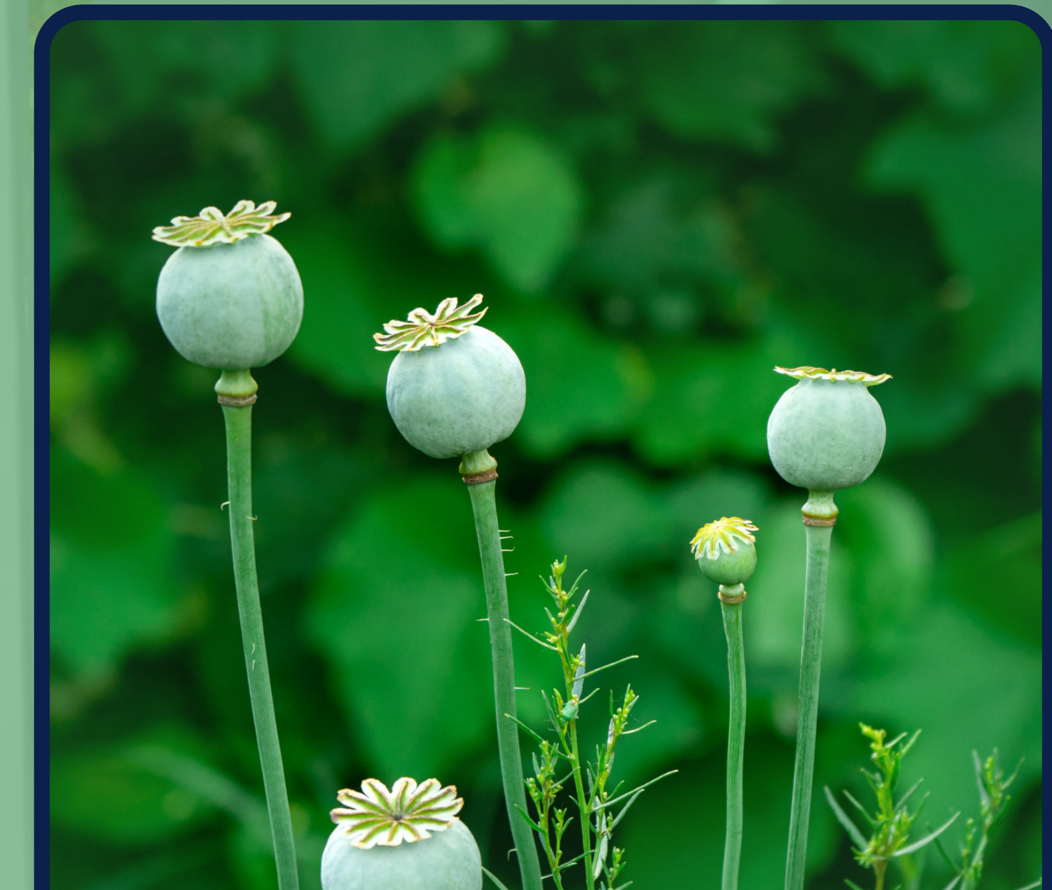
poppy seeds are dispersed from a 'pepper pot' head, when the wind blows the seeds shake out