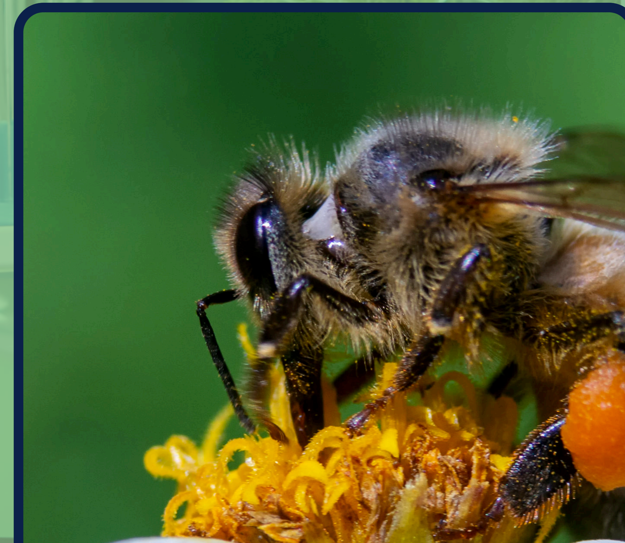
many flowers rely on animals to help with pollination by moving pollen from one flower to another

spreading things out over an area , seeds do this to help to reproduce