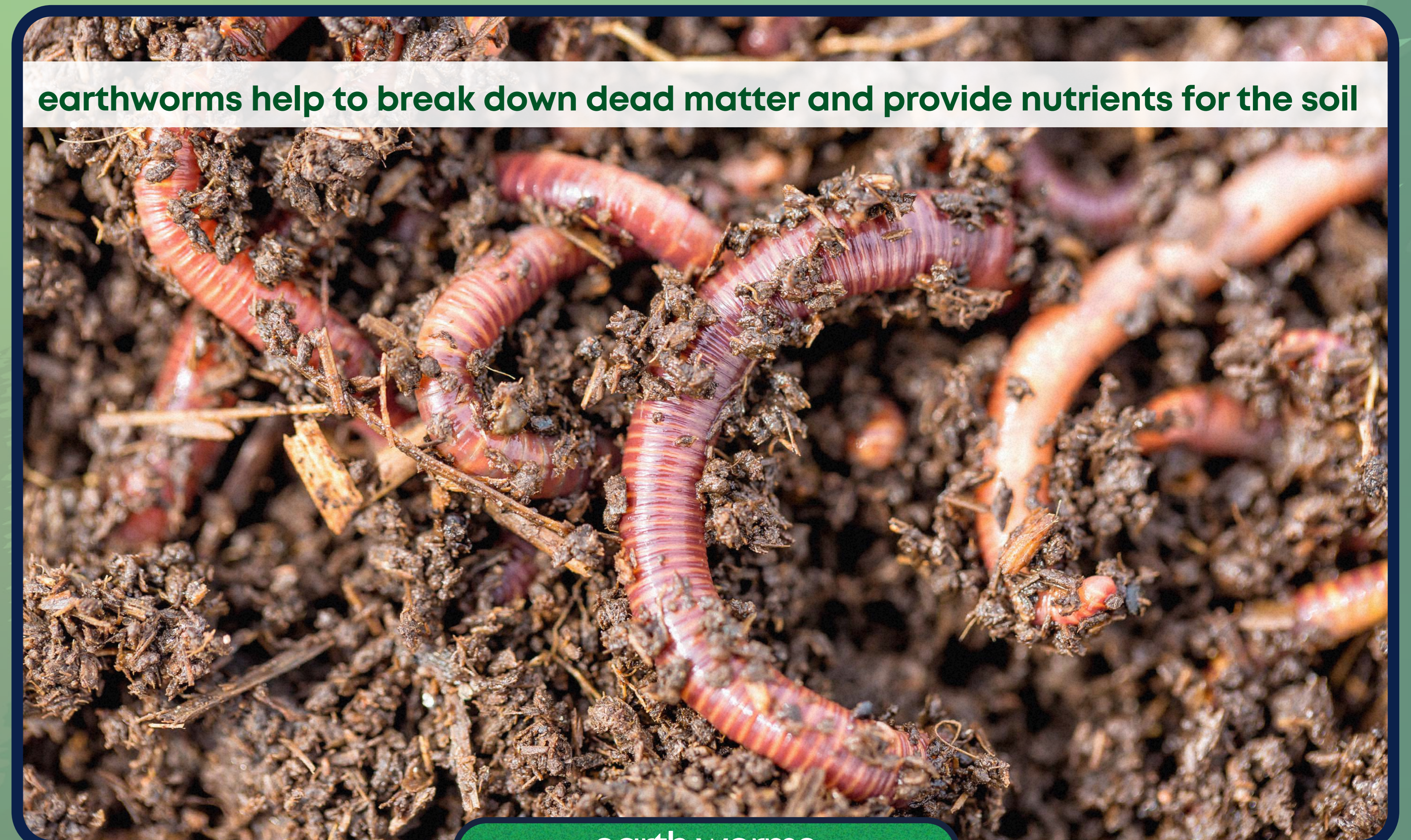
earthworms help to break down dead matter and provide nutrients for the soil