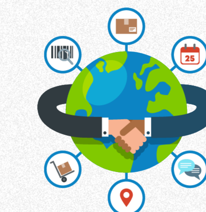
where the UK trades