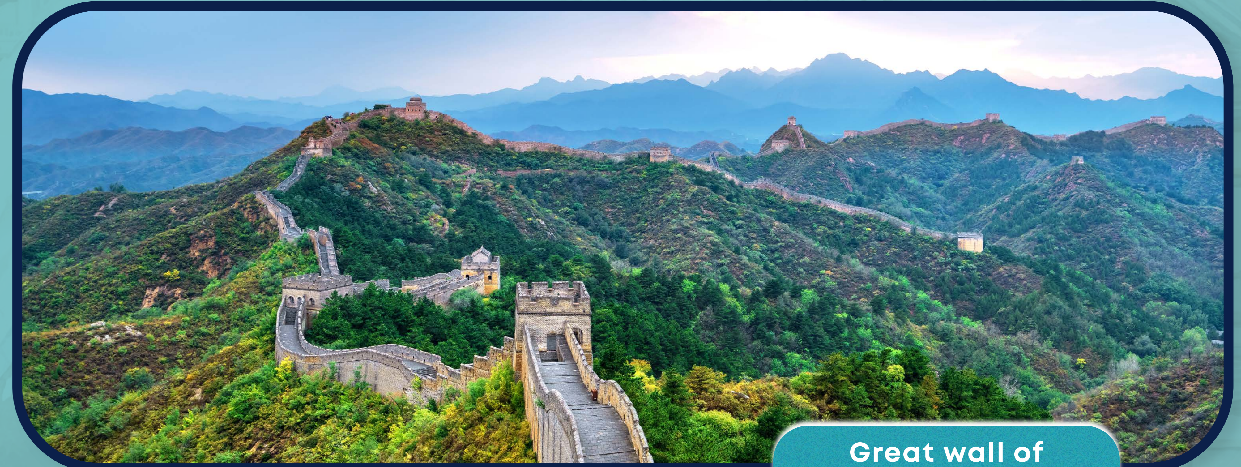
Great wall of China