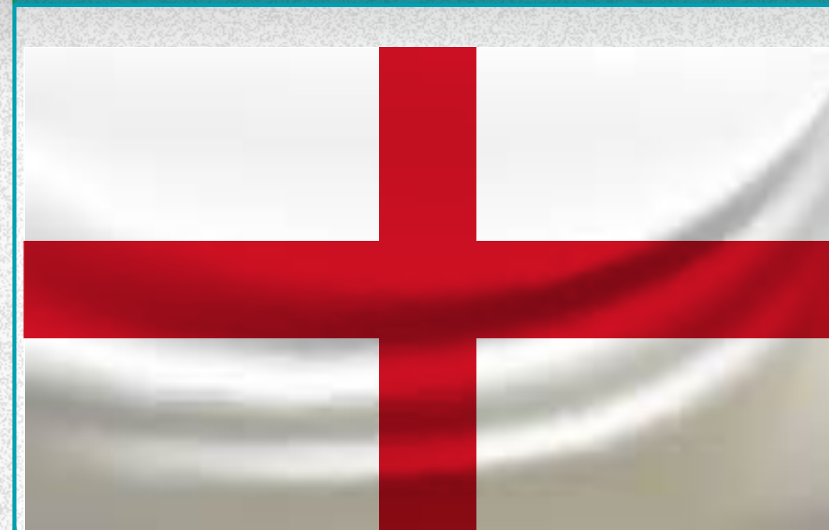
St George's Cross (England)