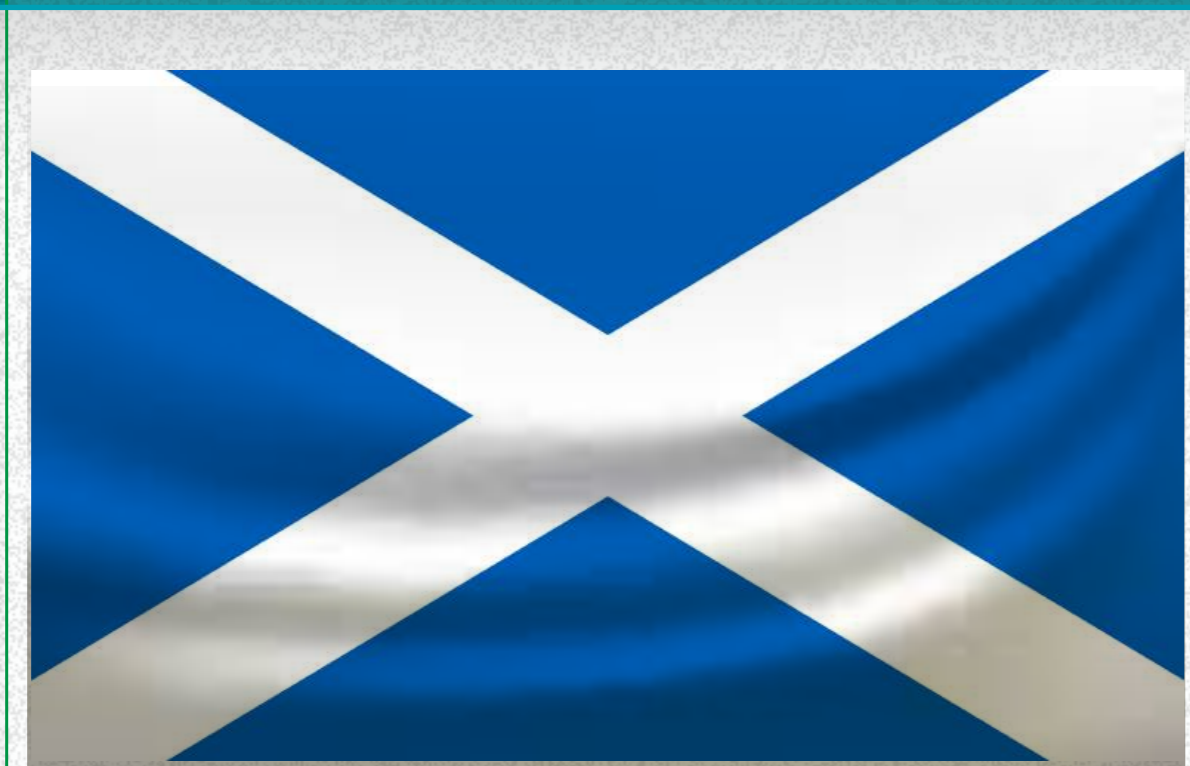
St Andrew's Cross (Scotland)