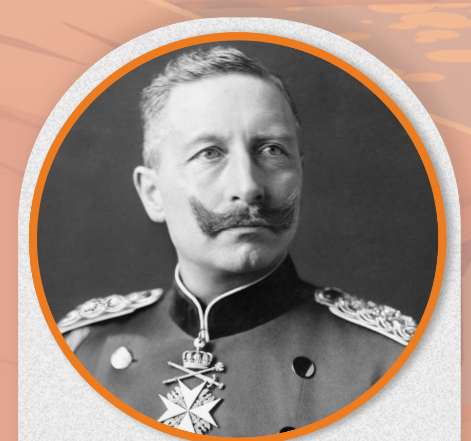
German Emperor during WWI