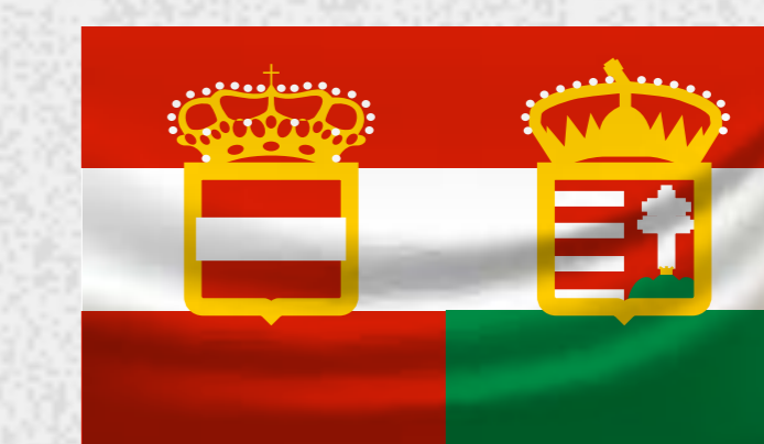
Austria - Hungary