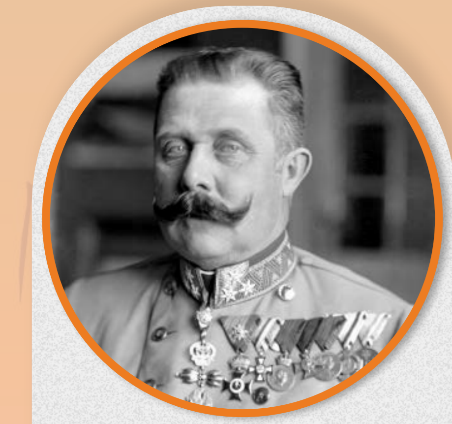
heir to the Austrian-Hungarian throne: assassinated in 1914