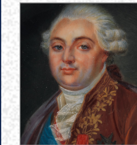
King Louis XVI

crowned King of France in 1774 (an absolute monarch, beheaded in 1793)