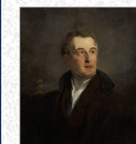
Duke of Wellington

British admiral in the Royal Navy who defeated Napoleon at the Battle of Trafalgar, preventing an invasion