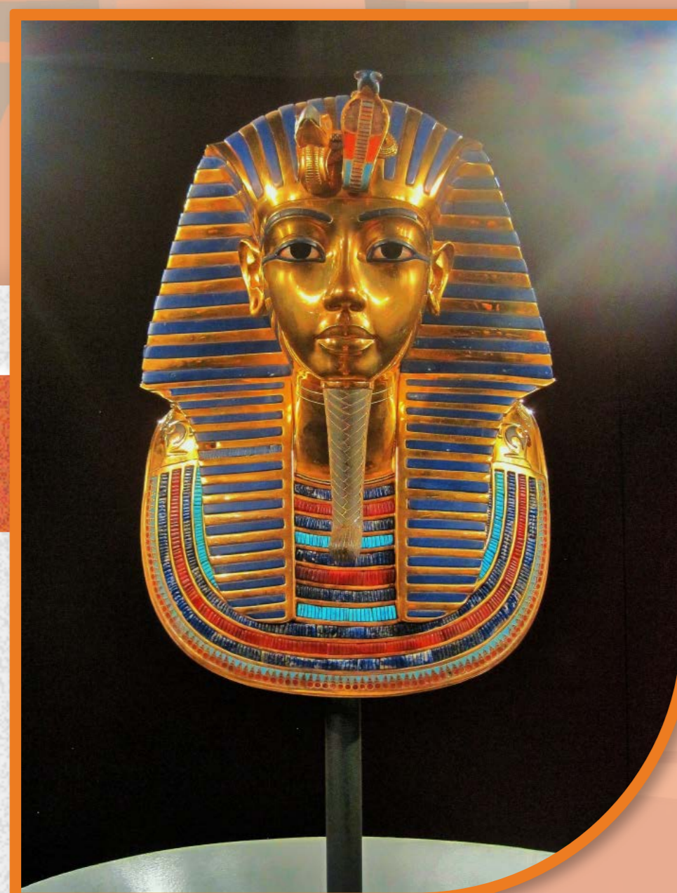
ancient Egyptian Pharaoh