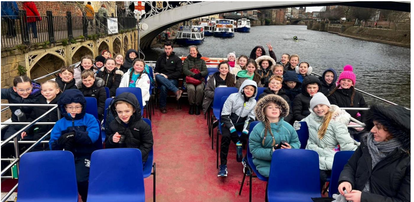
Whilst cruising along the river, they were able to soak in all the many historic and modern sights of the wonderful city.