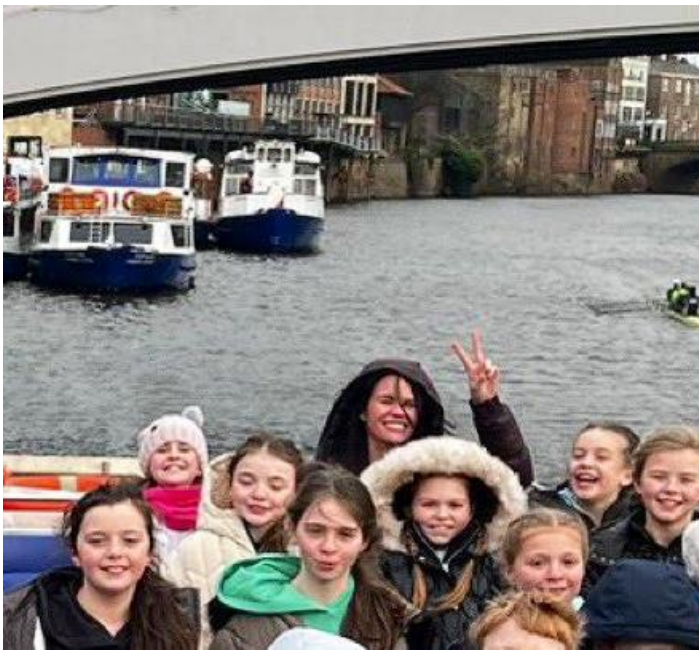
Although the weather was blustery, the cruise was one that the children will always remember!