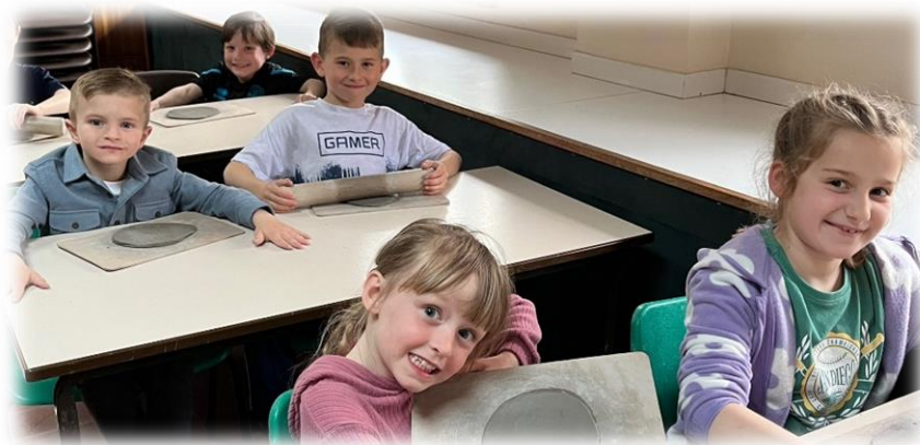
The children thoroughly enjoyed their pottery lesson in the workshop, after their super tasty dinner.