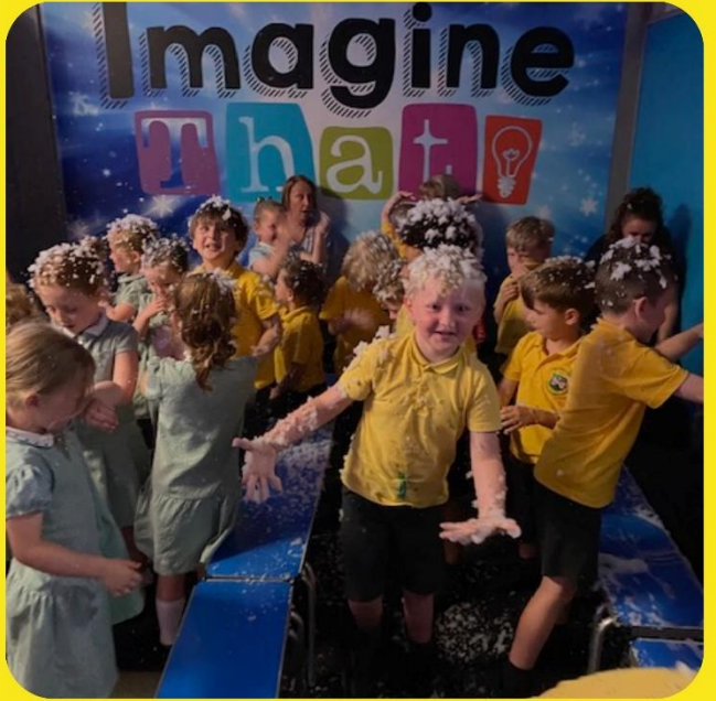
All the children enjoyed taking part in the activities, particularly the Dry Ice Sensory Adventure Science show, stimulating their senses and more importantly – covering them with dry ice!