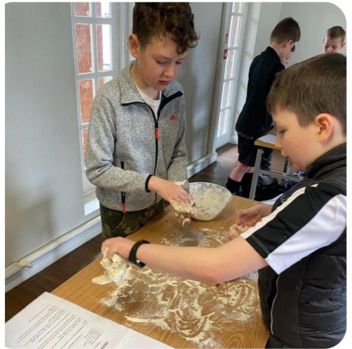
Roman Bread Making was another activity that the children experienced. Kneading and rolling their dough, all the children were thoroughly engaged in this activity.