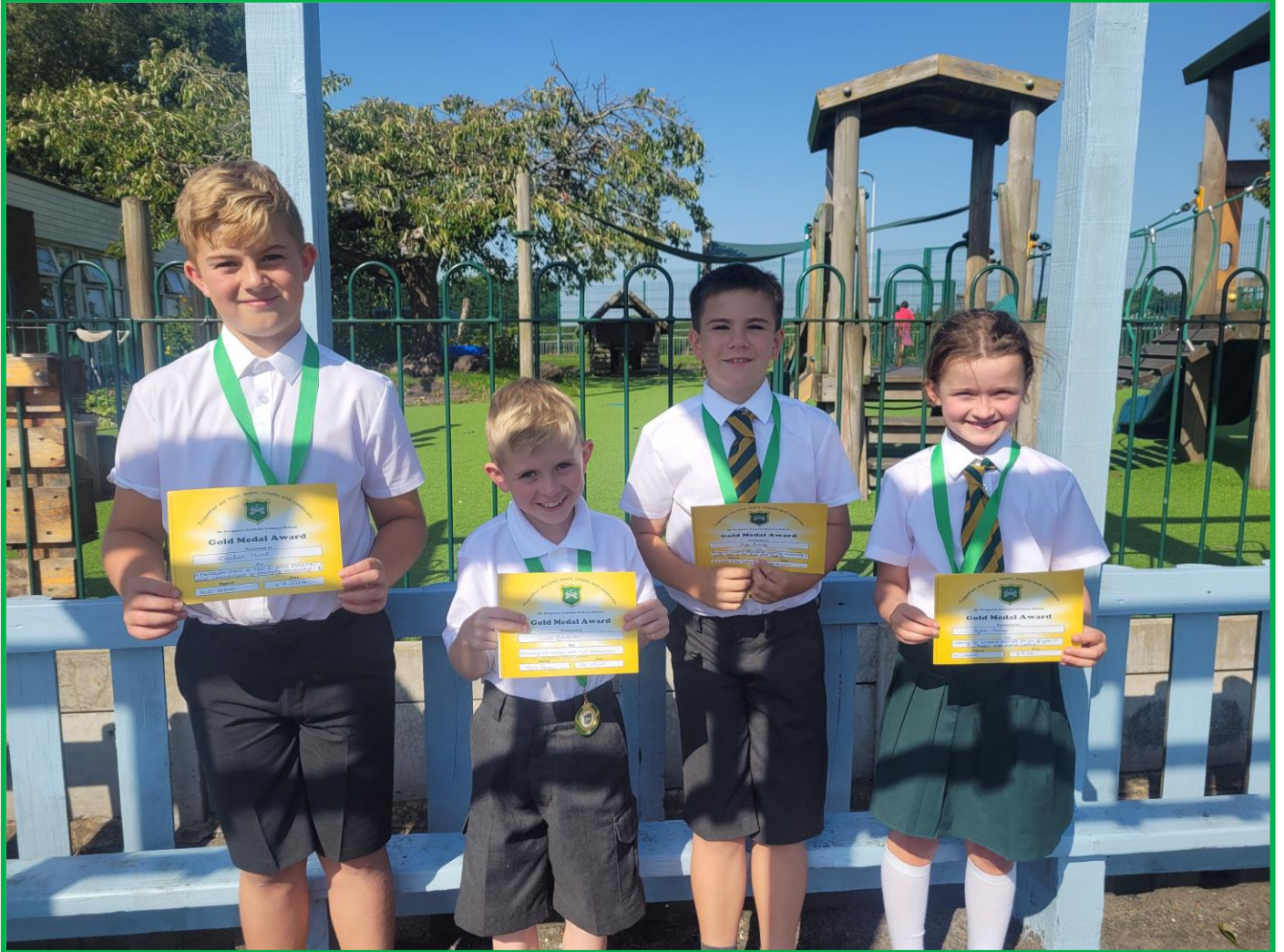
Congratulations to our KS2 Gold Medal Winners