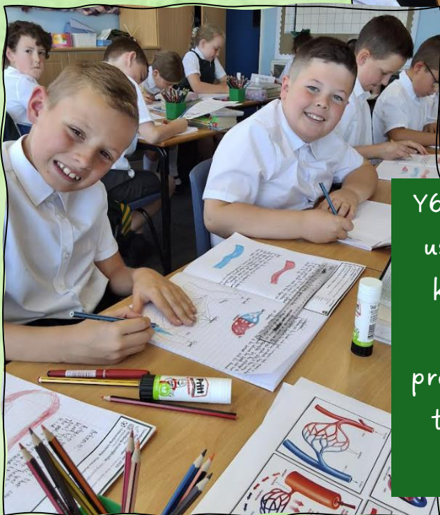
Y6 have impressed us with excellent knowledge and beautifully presented work on the circulatory system!