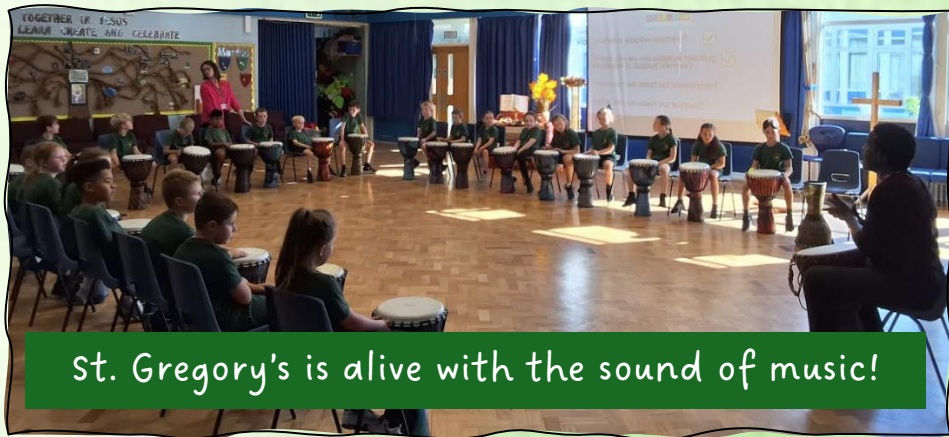
St. Gregory's is alive with the sound of music!