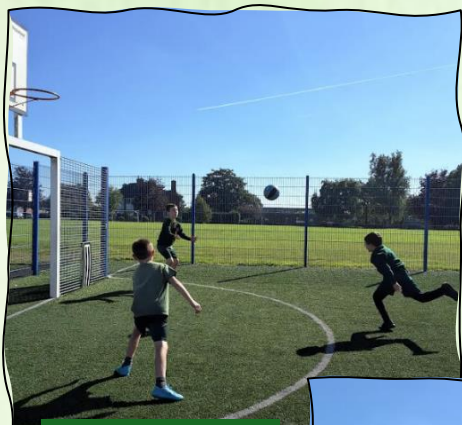
All classes are thoroughly enjoying our specialist PE lessons!