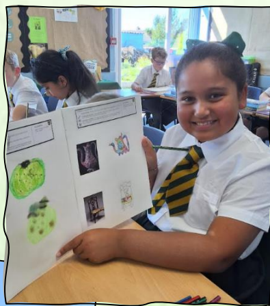
Super artwork from Year 5, exploring style in art.