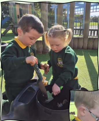
Nursery class have been busy planting bulbs.