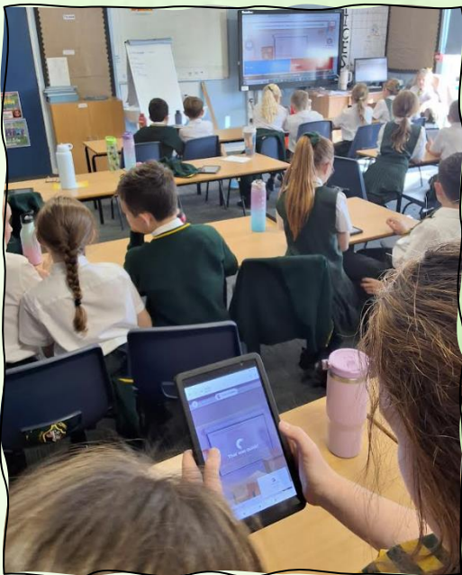
Tension, excitement and energy were all high in Y4 as the children used technology to practice their knowledge retrieval!