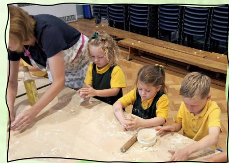
Y2 had the best time mixing, kneading, rolling and baking pizzas!