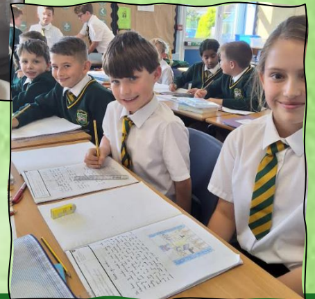
Y5 historians (or should I say scholars?) learning about the House of Wisdom.